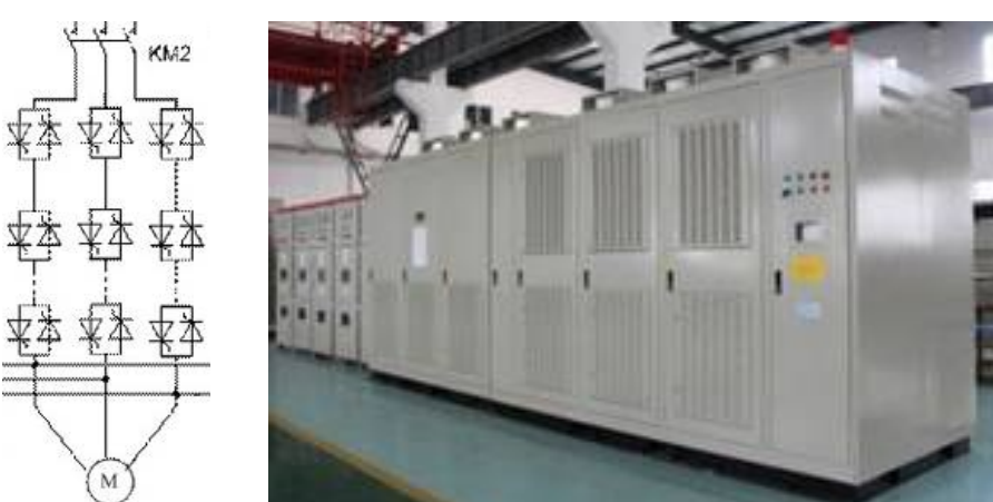
Fig. 3: Schematic structure of a high-voltage soft starter

To control the high voltage AC motors (e.g. 10kV), the output voltages of the soft starter must be correspondingly high enough. The high output voltage can be reached through the thyristors in series connection (Fig. 3). In order to ensure the homogeneous voltages on the power semiconductors and the similar electrical characterizations (blocking homogeneities, turn-on ratios and recovery properties) of the components in series connection are important. Regarding series connection of power semiconductors, you can find also more information in the last issue of our newsletter (2015 edition 6).